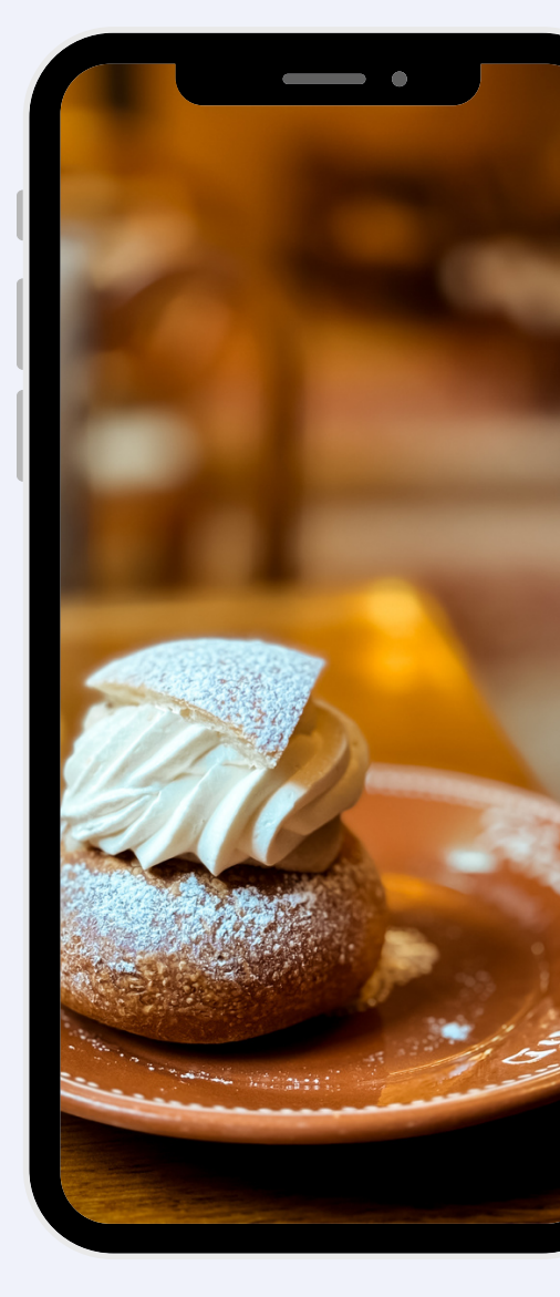
Patisserie David Malmö

Click on the chosen photo to see examples of Reels/TikToks created for the partners.