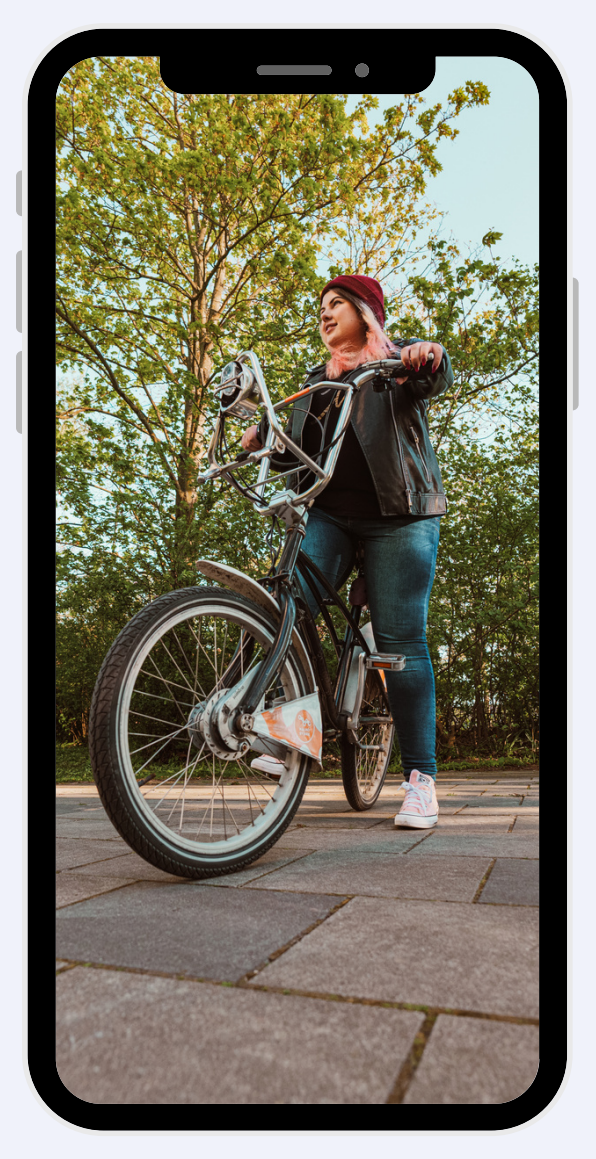
Malmö by Bike (own initiative)